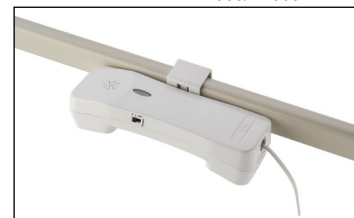
H2001 bedrail mount